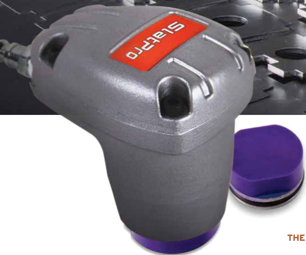
THE RHINO HAMMER™ DENESTING TOOL