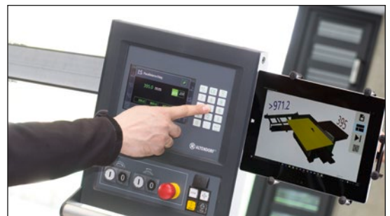
MAGIS indicates the operator on which fence the measure has to be adjusted.